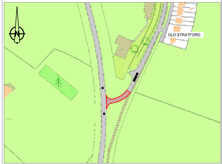
OVERVIEW PLAN SCALE: NTS

KEY: PROHIBITION OF DRIVING AT ALL TIMES (EXCEPT FOR BUSES)